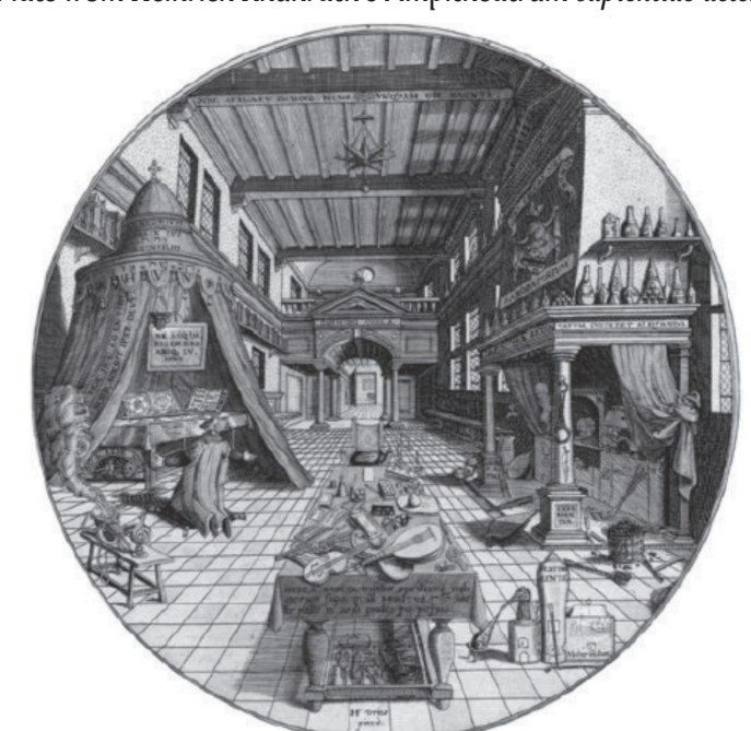
Plate from Heinrich Khunrath's Ampitheatrum sapientiae aeternae

This mode is nonlinear, simultaneous, intuitive instead of verbal-intellectual, and concerned more with relationships than with the discrete elements that are related. It is important to realize that this mode of consciousness is a way of seeing, and as such it can only be experienced in its own terms. In particular, it cannot be understood by the verbal-intellectual mind because this functions in the analytical mode of consciousness, for which it is not possible to appreciate adequately what