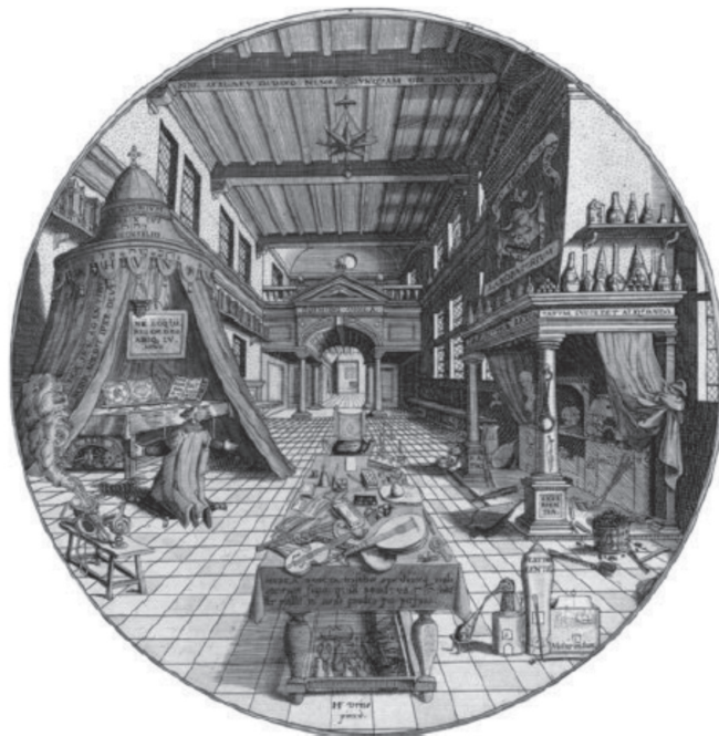
Plate from Heinrich Khunrath’s Ampitheatrum sapientiae aeternae